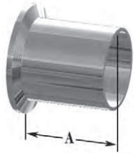
BPE Table #DT-22