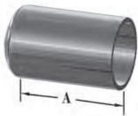
BPE Table #DT-30